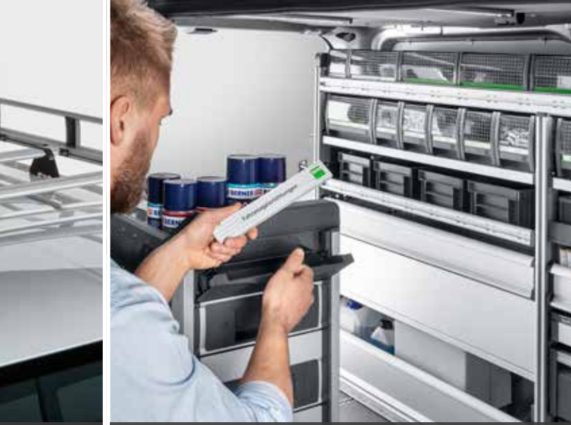
bott vario3 V-Box with folding rule