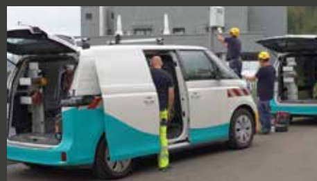
Electric fleet for green power