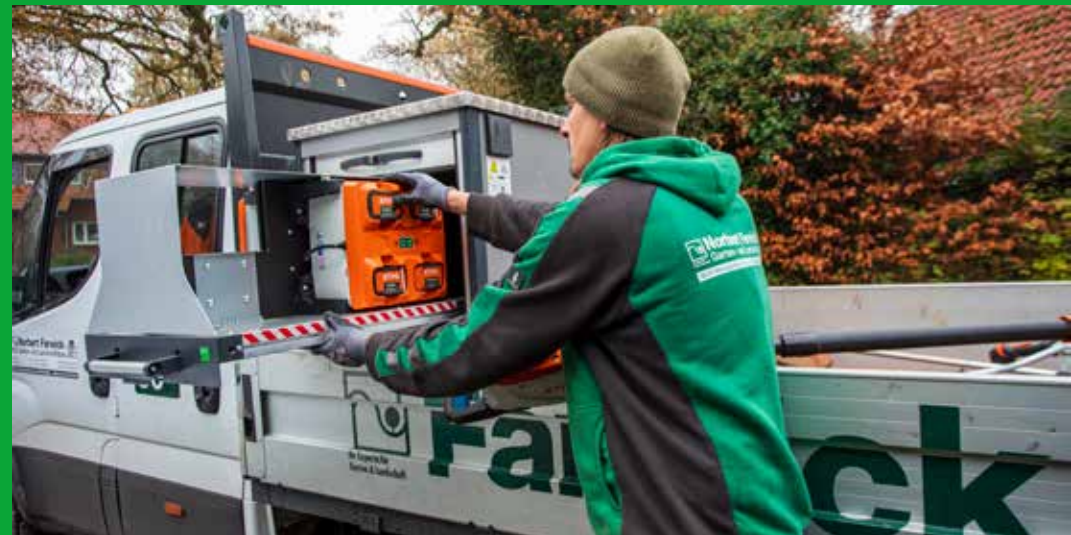
The bottTainer powered by STIHL – a new approach to landscape gardening