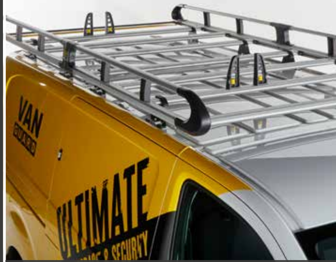
Optimised roof storage systems

Design your load space so it assists you in any situation – for faster load restraint, more comfortable working and maximum safety. A wide range of functional features help you with this.