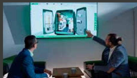
bott at a glance