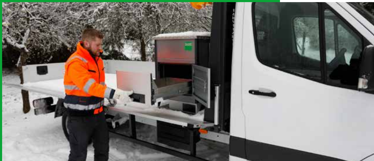
The bottTainer flatbed box – space-saving and accessible