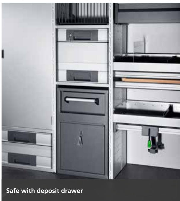
Safe with deposit drawer