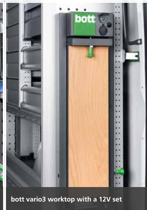
bott vario3 worktop with a 12V set