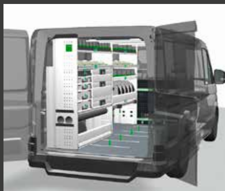
Conversion option 1 of 1,000

Select your vehicle make and model, and get a sneak preview of your new mobile workspace.