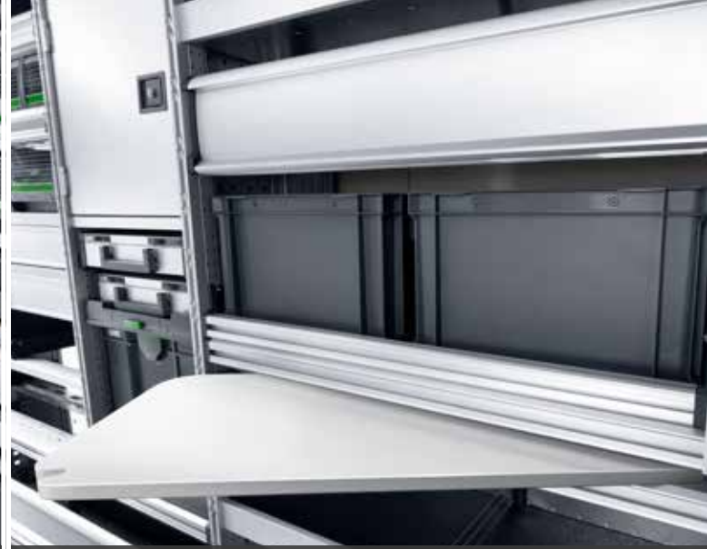
Swivel desktop – integrated into the van racking

Details matter when it comes to organisation