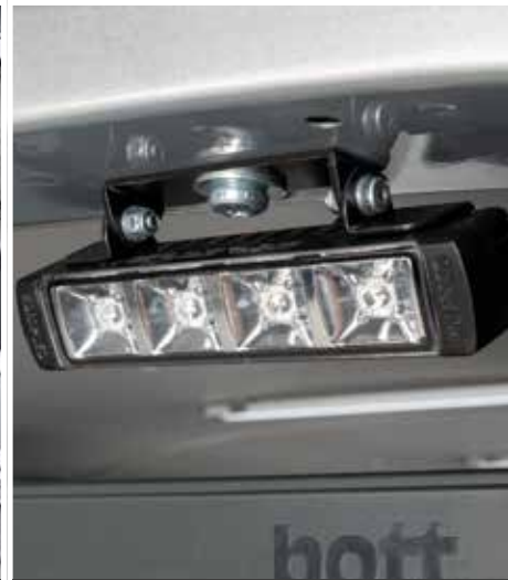
Swivel and tilt LED work light