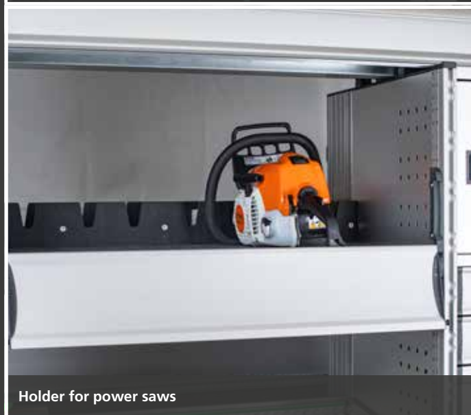
Holder for power saws