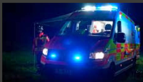
Mobile command centre for DRK