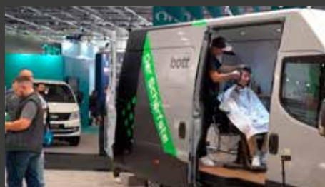
Trade show insights