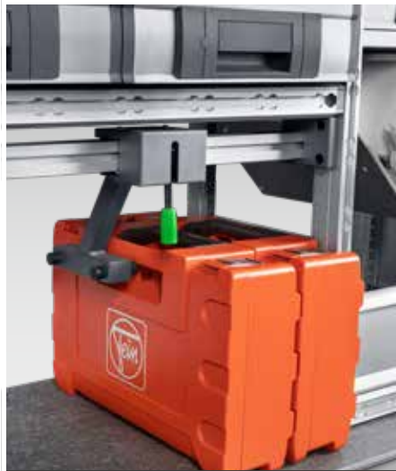
Clamp unit for securing different case sizes

Details matter when it comes to organisation