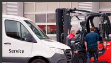
Service – mobile and on-site