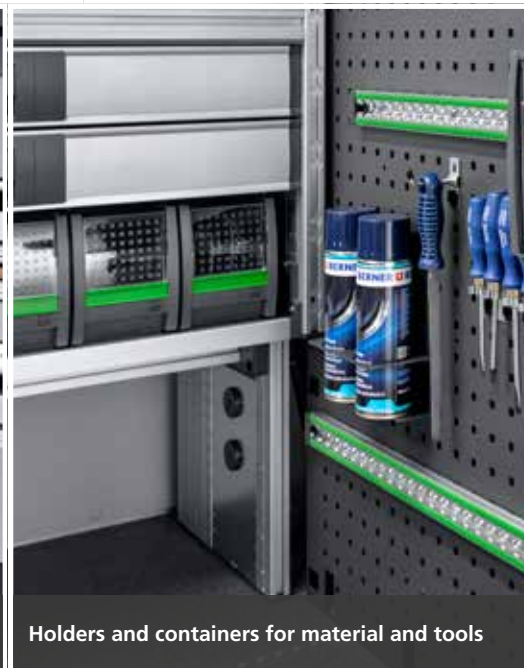
Holders and containers for material and tools