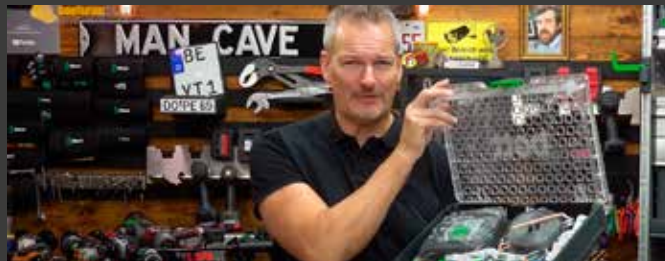
Expert talk on the YouTube channel Bauforum24