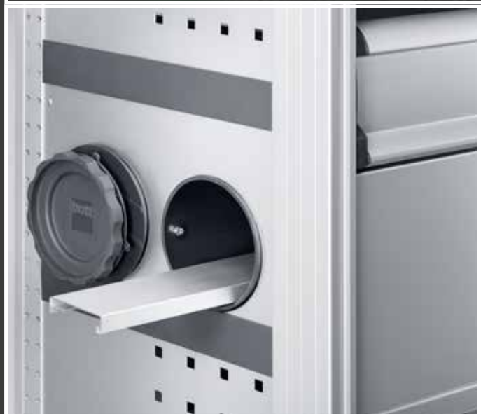
Long item storage, for example for pipes or guide rails