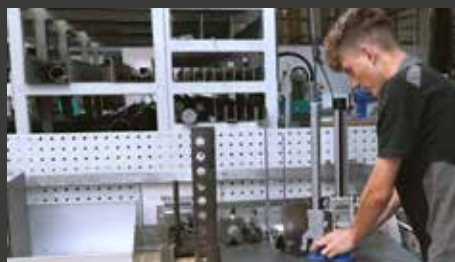
Behind the scenes