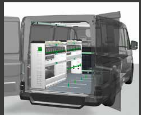
Conversion option 2 of 1,000